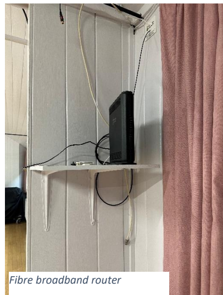
Fibre broadband router