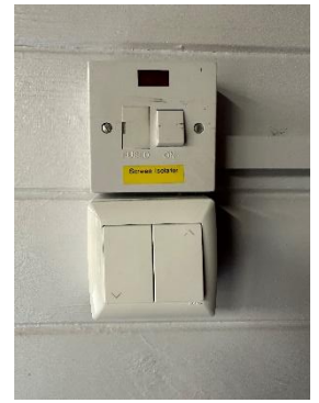
Switch to raise and lower the screen