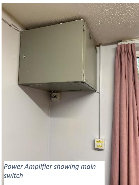
Power Amplifier showing main switch